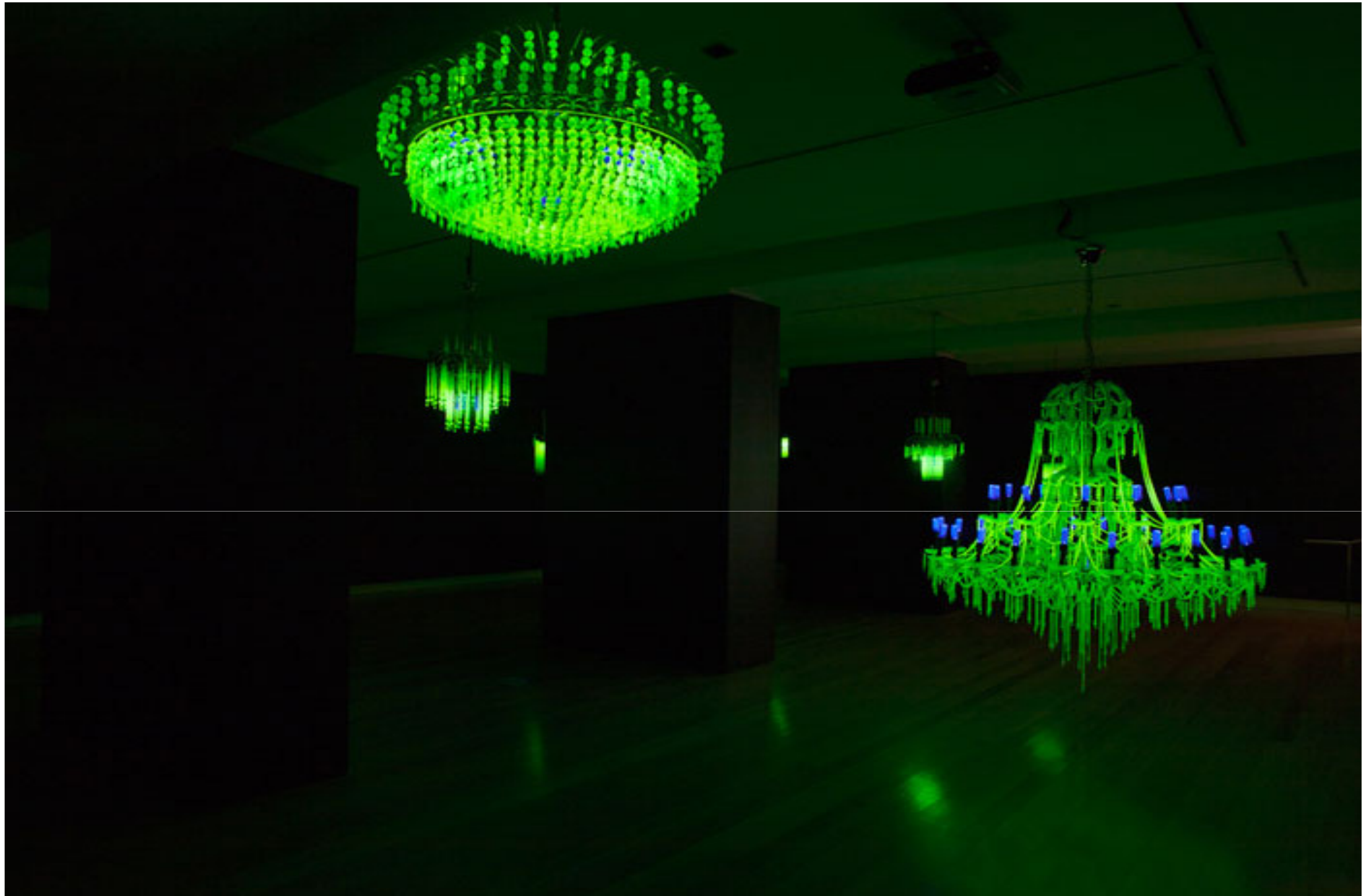
Installation view of Foundation's edge: artists and technology Photo: Richard Stringer http://www.artmuseum.qut.edu.au/exhibit/2013/foundations.jsp