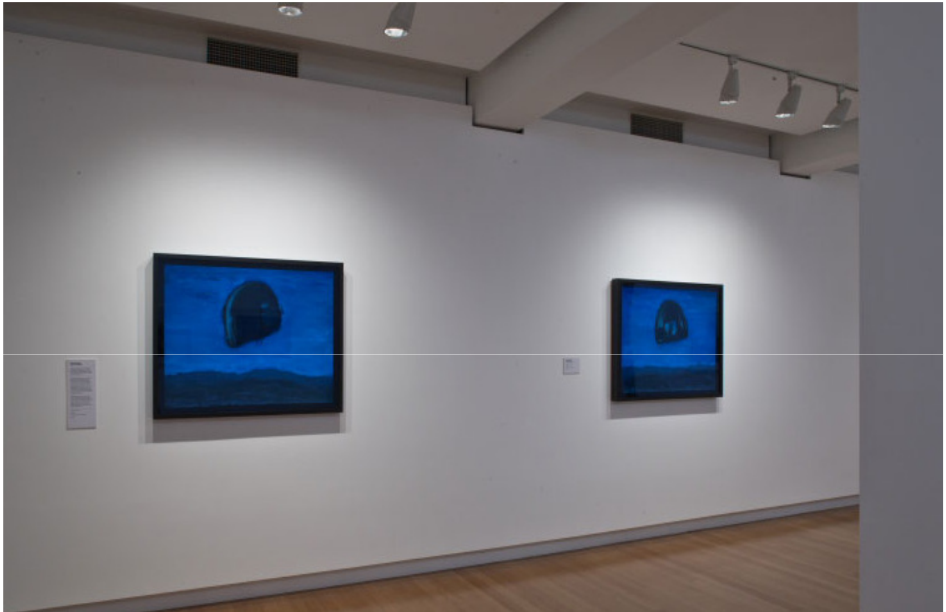
Installation view of Shaun Gladwell: Afghanistan