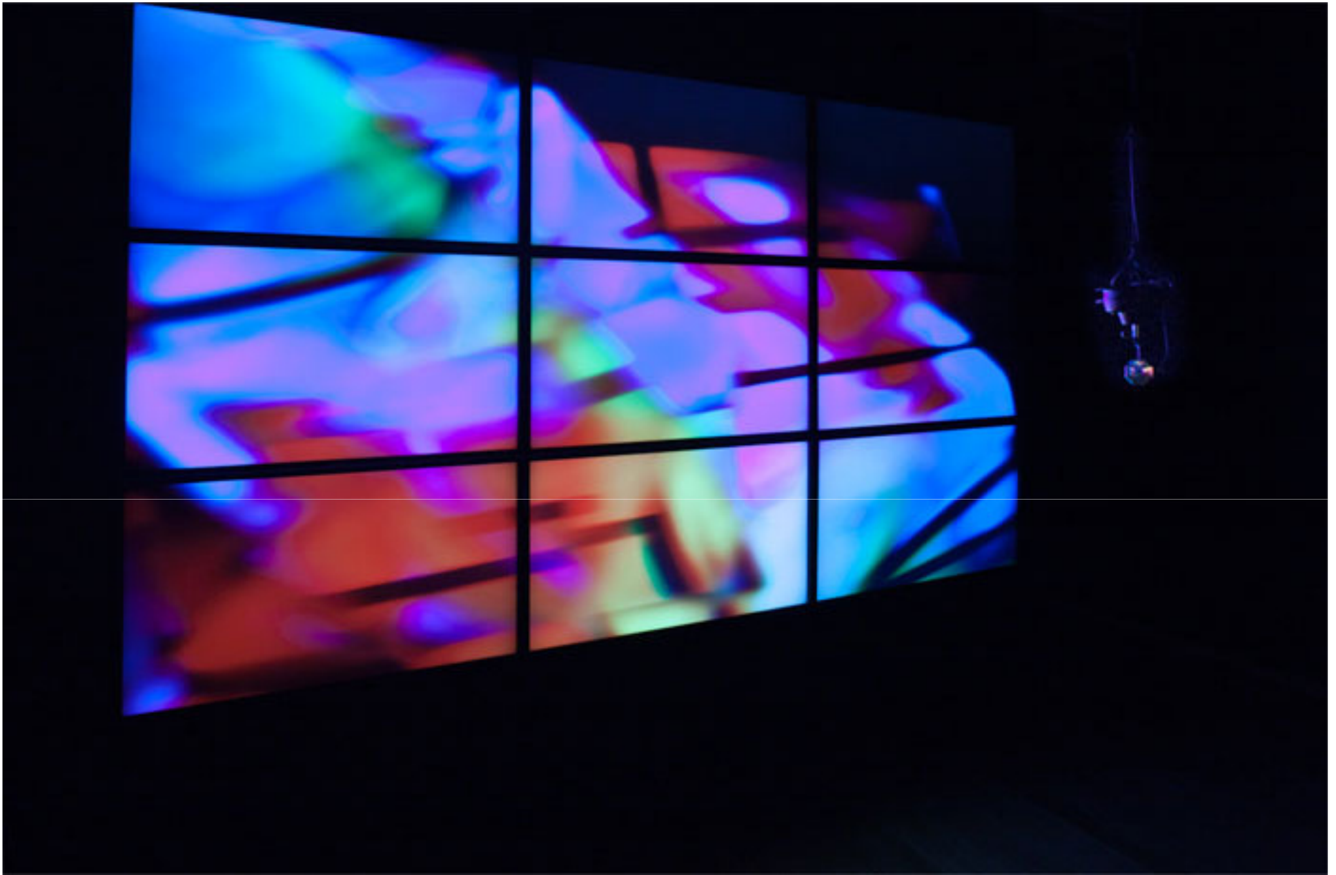
Installation view of Foundation's edge: artists and technology